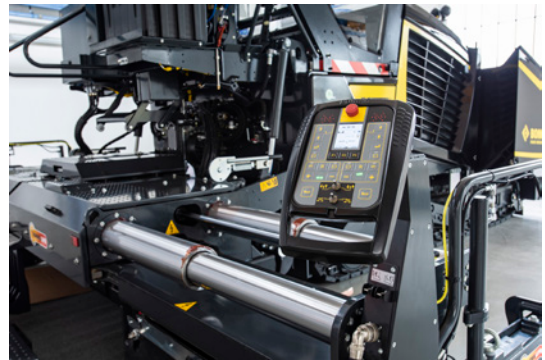
Full control from the side. The integrated levelling controller and automatic inclination ensure perfect quality.