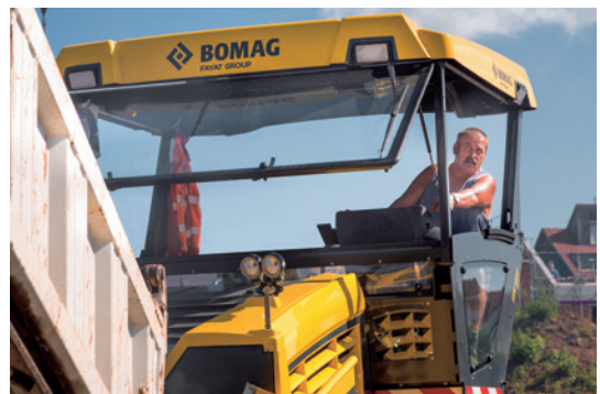
The right position in each situation – the comfortable driver's cabin.