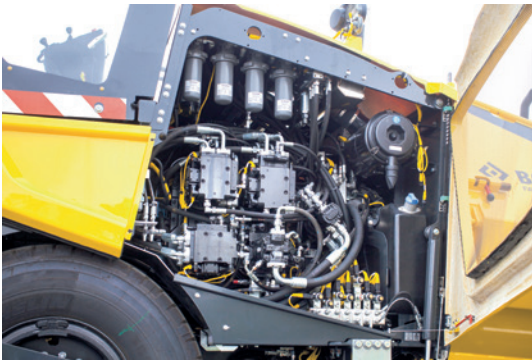
Save up to 17 % fuel – demand-driven hydraulics – with BOMAG ECOMODE.