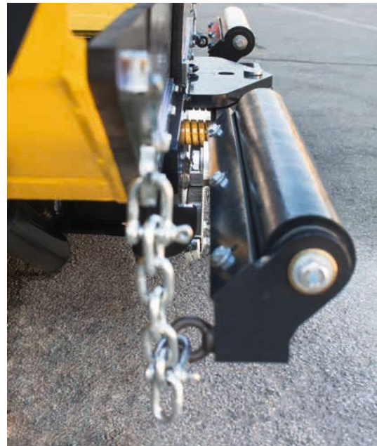
Impact-free docking – dampened bumper.