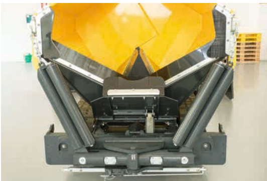
Hydraulic front gate – for a clean material flow.