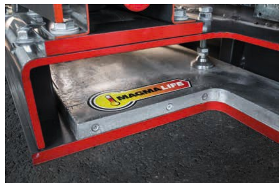
Heats up nearly 60 % quicker – unique MAGMALIFE heating system.