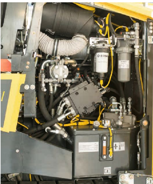
Save up to 17 % fuel – demand-driven hydraulics – with BOMAG ECOMODE.